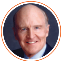
Jack Welch Former Chairman of General Electric