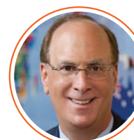
Laurence D. Fink

Global Managing Partner of McKinsey & Company