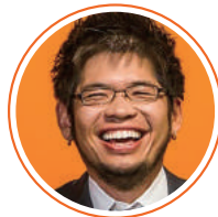
Steve Chen Co-Founder of YouTube