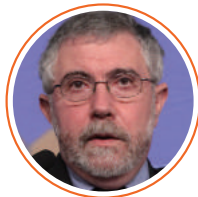
Paul Krugman Professor at City University of New York