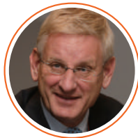
Carl Bildt The 40 th Prime Minister of Sweden and GCIG Commissioner