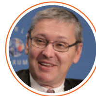
Gregory Mankiw Professor at Harvard University