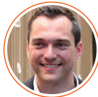
Nathan Blecharczyk Co-Founder of Airbnb