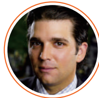
Donald Trump Jr. Executive Vice President of the Trump Organization