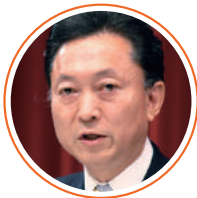
Yukio Hatoyama The 93 rd Prime Minister of Japan