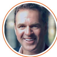
Niall Ferguson Professor at Harvard University