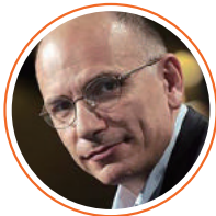
Enrico Letta The 55 th Prime Minister of Italy