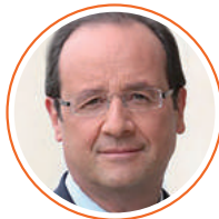
François Hollande The 24 th President of France