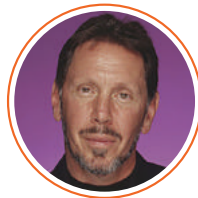
Larry Ellison Chairman and CTO of Oracle Corporation