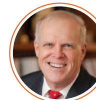
John L. Hennessy