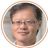
Jerry Yang Founder of Yahoo