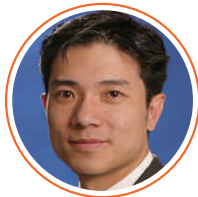
Robin Li Chairman and CEO of Baidu