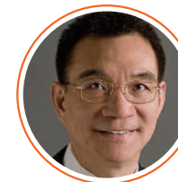
Justin Yifu Lin

Professor at National School of Development at Peking University