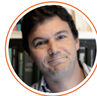
Thomas Piketty Professor at Paris School of Economics