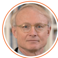
Michael Porter Professor at Harvard University