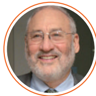
Joseph E. Stiglitz 2001 Nobel Prize Laureate in Economics