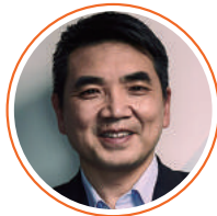
Eric Yuan Founder and CEO of Zoom