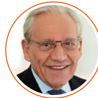
Bob Woodward Pulitzer Prize-Winning Journalist