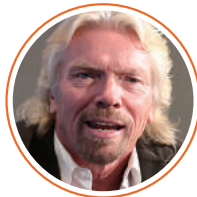
Richard Branson Founder & CEO of Virgin Group