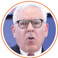
David Rubenstein Co-Founder and Co-CEO of the Carlyle Group