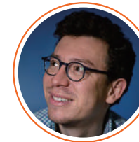
Luis von Ahn