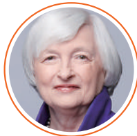
Janet L. Yellen The 15 th Chair of the Federal Reserve board