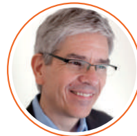
Paul M. Romer Professor at NYU Stern School of Business