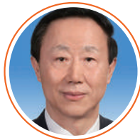
Wang Jia Rui Vice Chairman of the 12 th National Committee of the Chinese People's Political Consultative Conference