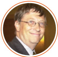
Bill Gates Co-Founder of Microsoft Corporation