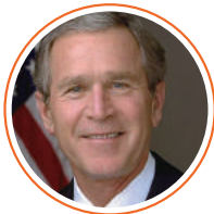
George W. Bush The 43 rd President of the United States