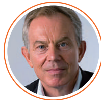
Tony Blair The 73 rd Prime Minister of United Kingdom