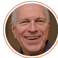
Edmund Phelps 2006 Nobel Prize Laureate in Economics