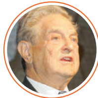
George Soros Chairman of Soros Fund Management