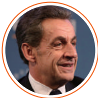
Nicolas Sarkozy The 23 rd President of France