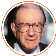
Alan Greenspan The 13 th Chairman of Federal Reserve Board