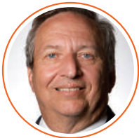
Larry Summers Professor at Harvard University