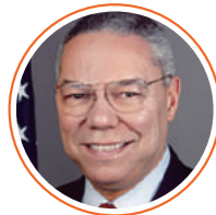
Colin Powell The 65 th United States Secretary of state