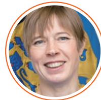
Kersti Kaljulaid President of Estonia