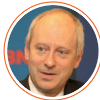
Michael Sandel Professor at Harvard University