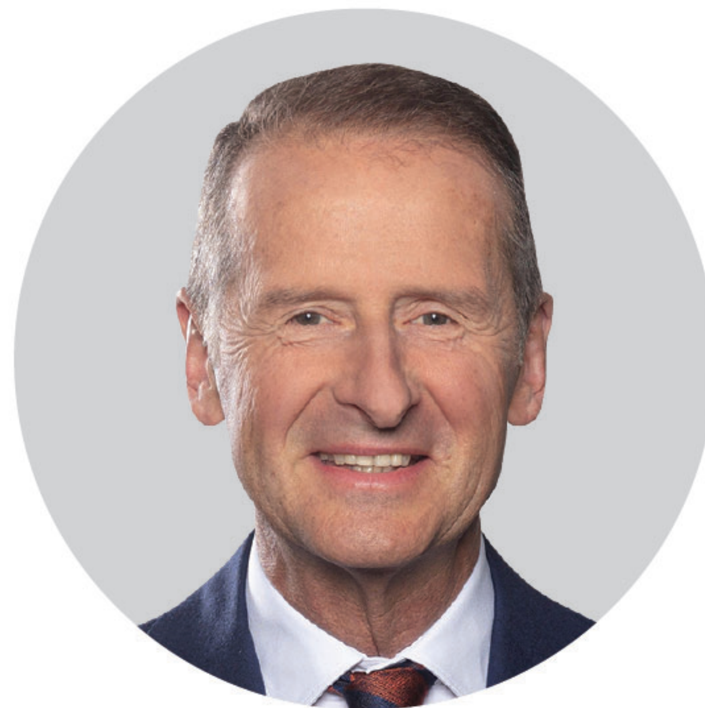
Herbert Diess Chairman of the Supervisory Board, Infineon Technologies

In an academic environment dominated by liberal optimism after the end of the Cold War, he emphasized that conflict among great powers remains inevitable. According to his theory, great powers pursue hegemony sufficient to overwhelm their rivals, leading to a balance of power shaped by fear and calculation. He identifies the anarchic nature of the international system, states’ survival instincts, and military competition as the key variables. His major works include “The Tragedy of Great Power Politics” and “The Israel Lobby and U.S. Foreign Policy.” Mearsheimer interprets contemporary international issues—such as the Russia-Ukraine war and cross-strait relations through a realist lens, greatly influencing experts in diplomacy and security.