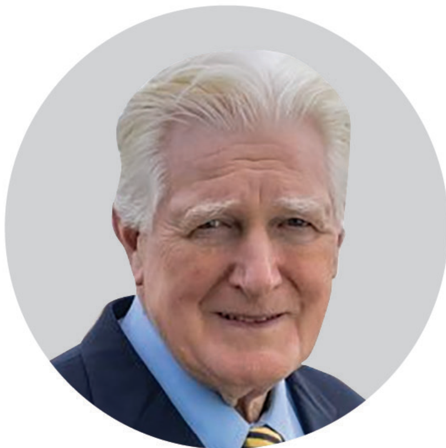
Jim Moran CEO of Moran Strateies Former U.S. Congressman