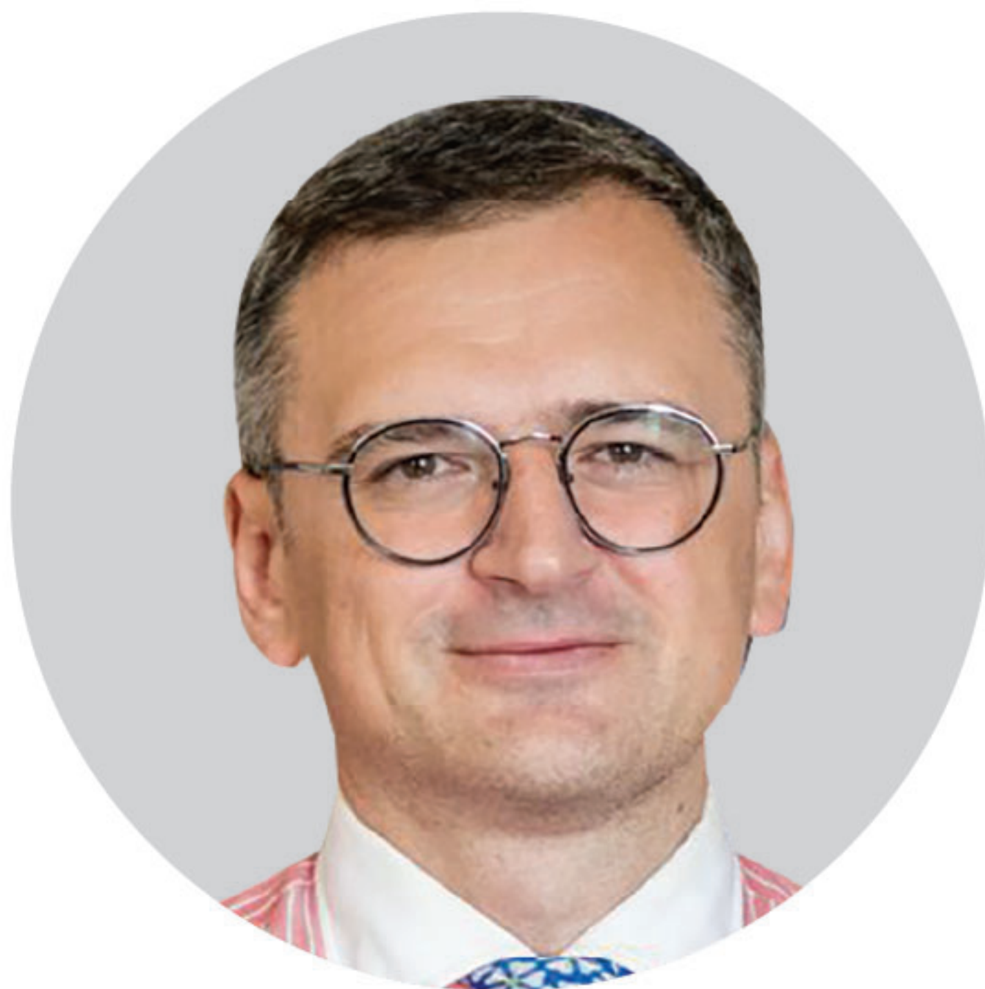
Dmytro Kuleba Former Minister of Foreign Affairs of Ukraine

He built his career at 3M, a global comprehensive manufacturing company that produces various industrial and consumer goods based on chemical technology. He joined 3M Korea as a regular employee and rose to become Senior Vice President at the U.S. headquarters. After joining LG Chem as CEO in 2019, he set the company’s three main growth pillars as battery materials, eco-friendly materials, and global new drugs, driving portfolio innovation. He currently serves as Chair of the World Economic Forum Chemical & Advanced Industry Community, Chairman of the National Academy of Engineering of Korea, and President of the Korea Chemical Industry Association. Born in 1957 in Goesan-gun, Chungbuk, he graduated from Cheongju High School and Seoul National University.