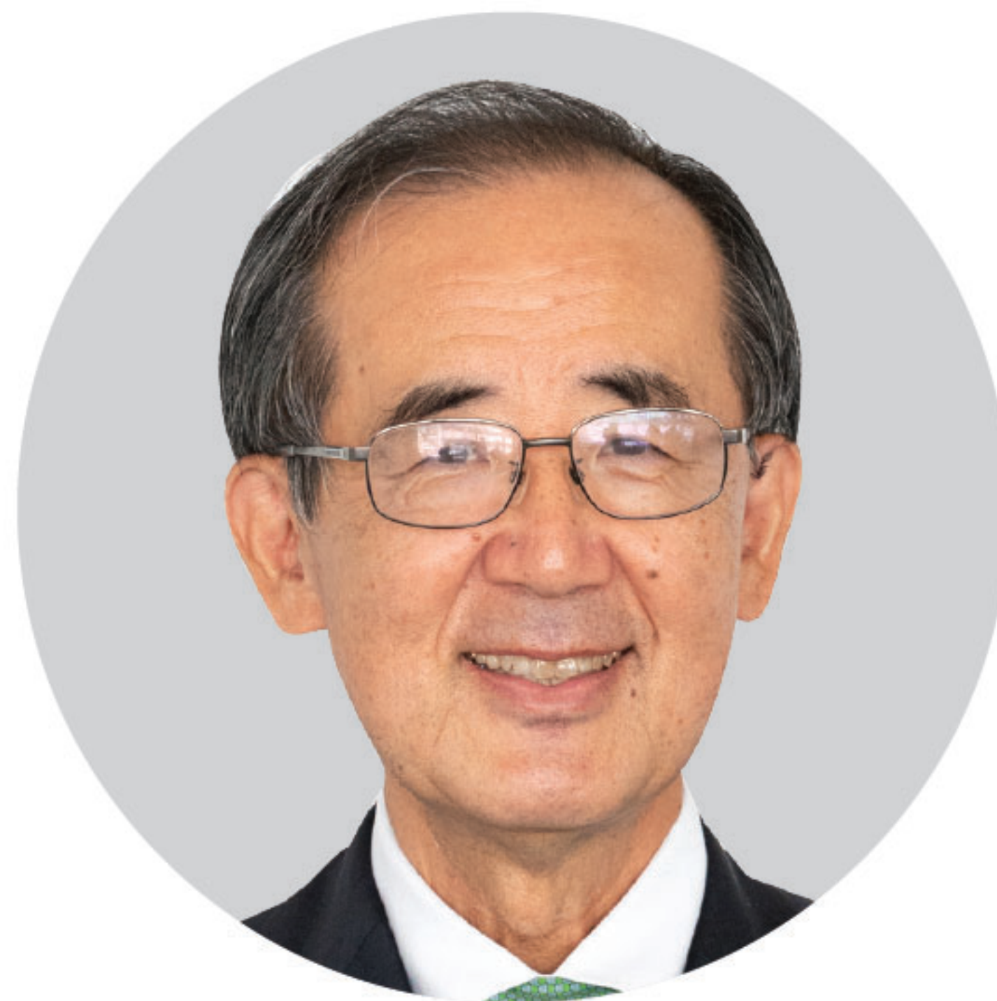
SHIRAKAWA Masaaki Former Governor of the Bank of Japan