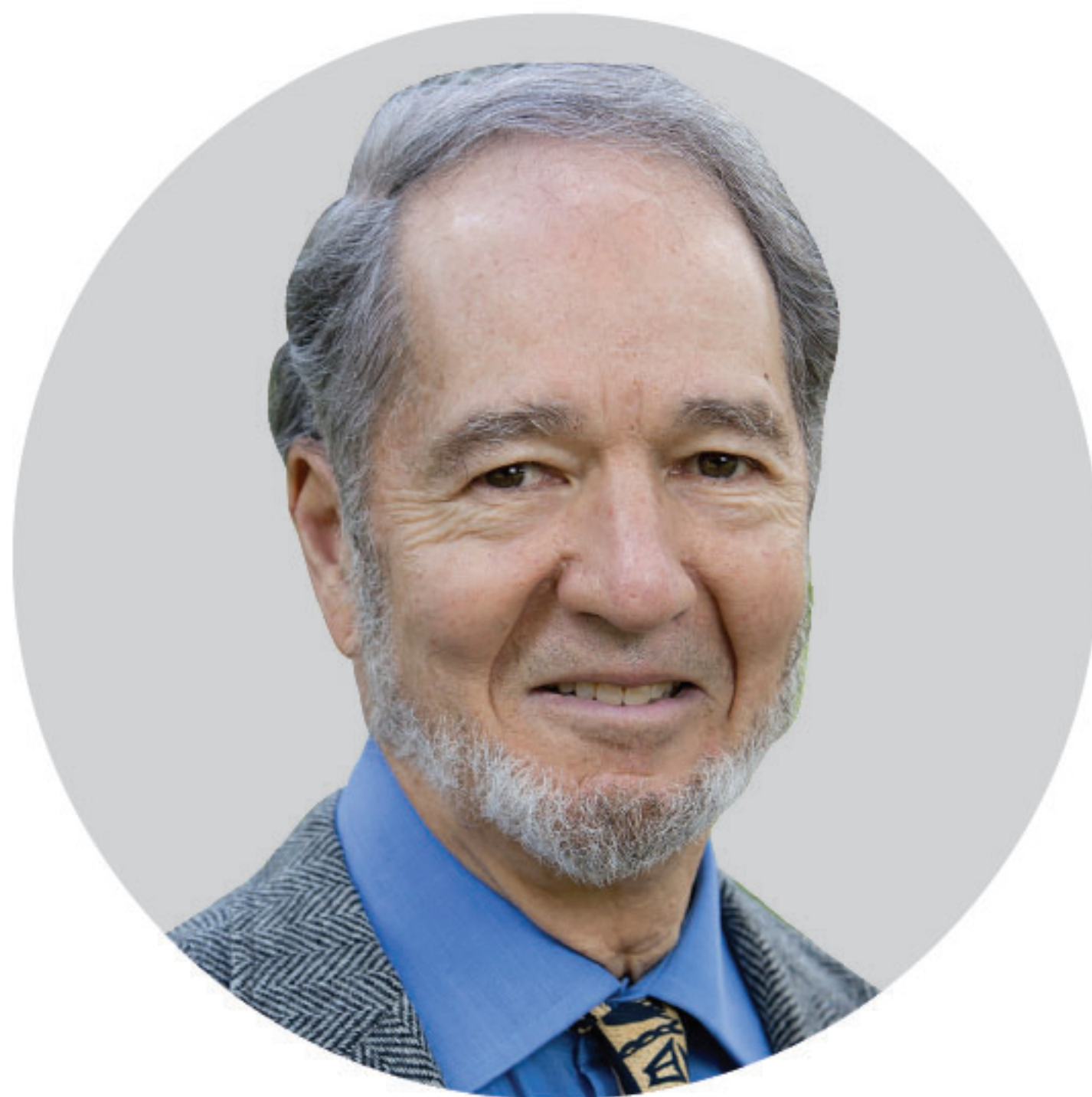
Jared Diamond Author of “Guns, Germs, and Steel” Emeritus Professor at UCLA

Trudeau entered politics in 2007 and led the Liberals to a historic majority in 2015 with his government taking bold action on many issues like climate change and poverty. He delivers powerful insights on building bridges to cultivate resilient communities and drive meaningful, lasting change.