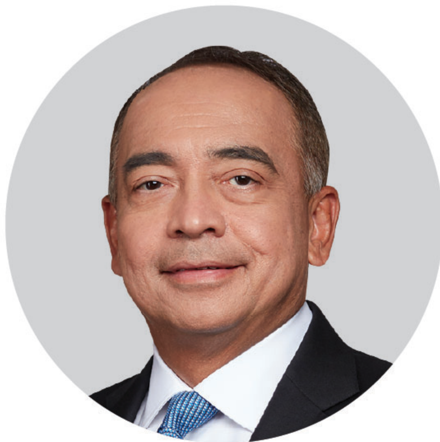
Nazir Razak Chairman of Ikhlas Capital Former Chairman of CIMB

A leader who has been at the forefront of the financial sector in Southeast Asia, including investment and M&A, based in Malaysia.