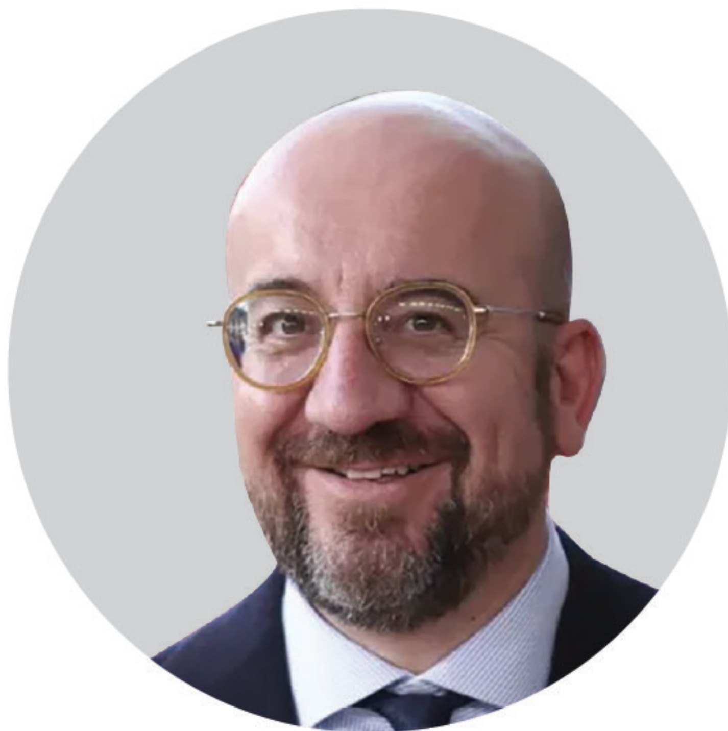
Charles Michel Former President of the European Council

He has received the U.S. National Medal of Science, the Pulitzer Prize for Nonfiction, the Tyler Prize for Environmental Science, and has been elected to the U.S. National Academy of Sciences. Beginning his research career in physiology, he expanded his work into ornithology, evolutionary biology, and biogeography. As an explorer, he rediscovered the Golden-fronted Bowerbird on a remote Pacific island. Diamond is renowned as a global intellectual, offering profound insights into modern civilization and environmental issues.