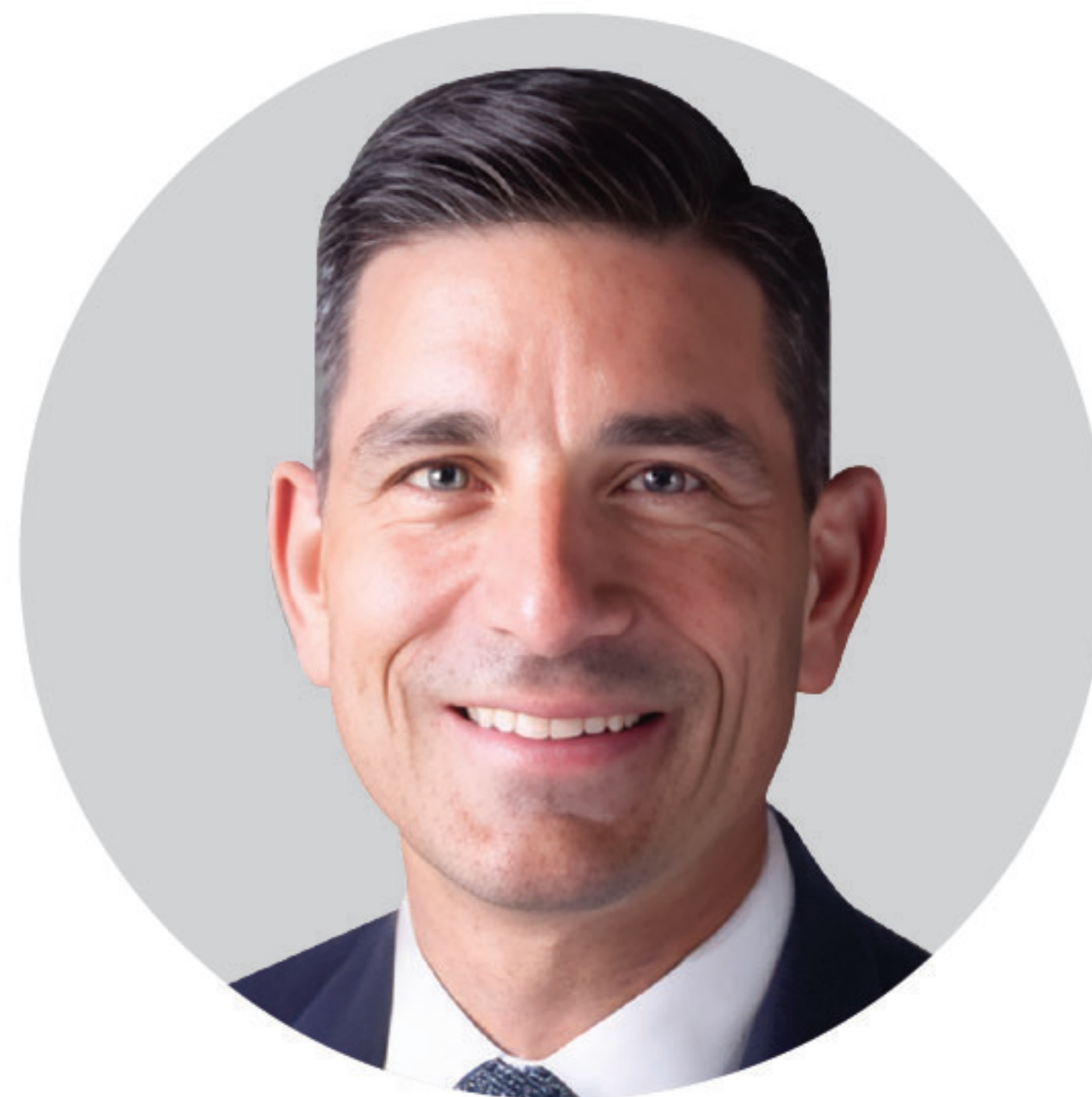
Chad Wolf Executive Vice President of America First Policy Institute (AFPI)