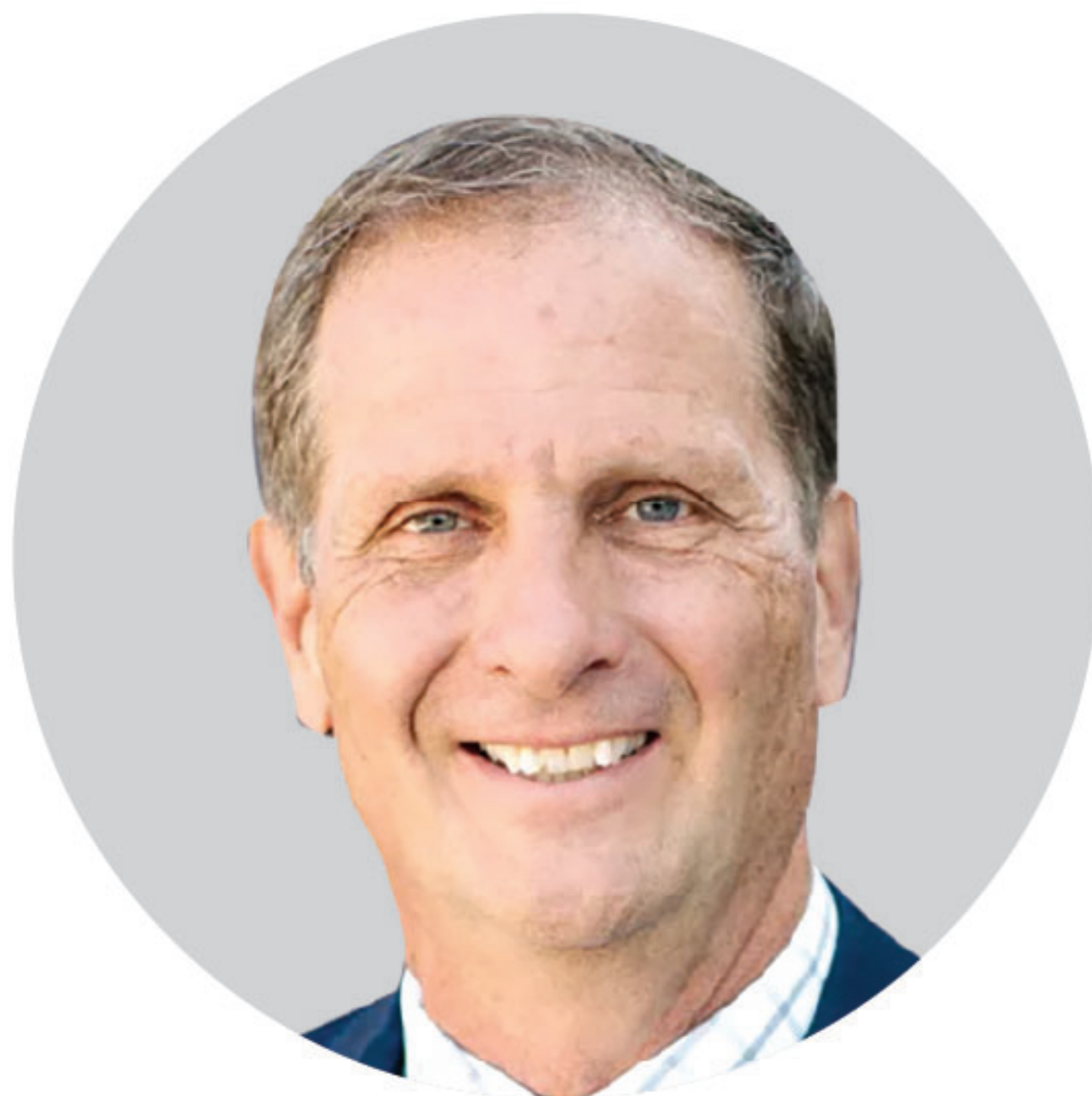
Chris Stewart Founder of Skyline Capitol Former U.S. Congressman

He exercised significant influence in legislation by serving as chairman or ranking member of key budget subcommittees on the House Appropriations Committee, including those for defense, environment, and health. In particular, he oversaw defense budgets for over 20 years, supervising weapons procurement, military medical research, base realignment, and cyber security. He was a founding member of the “New Democrat Coalition,” which pursues a centrist and pragmatic line within the Democratic Party, focusing on international trade, technological innovation, support for small and medium-sized enterprises, and balanced budgets. He is currently the head of Moran Global Strategies, a government relations and strategy consulting firm.