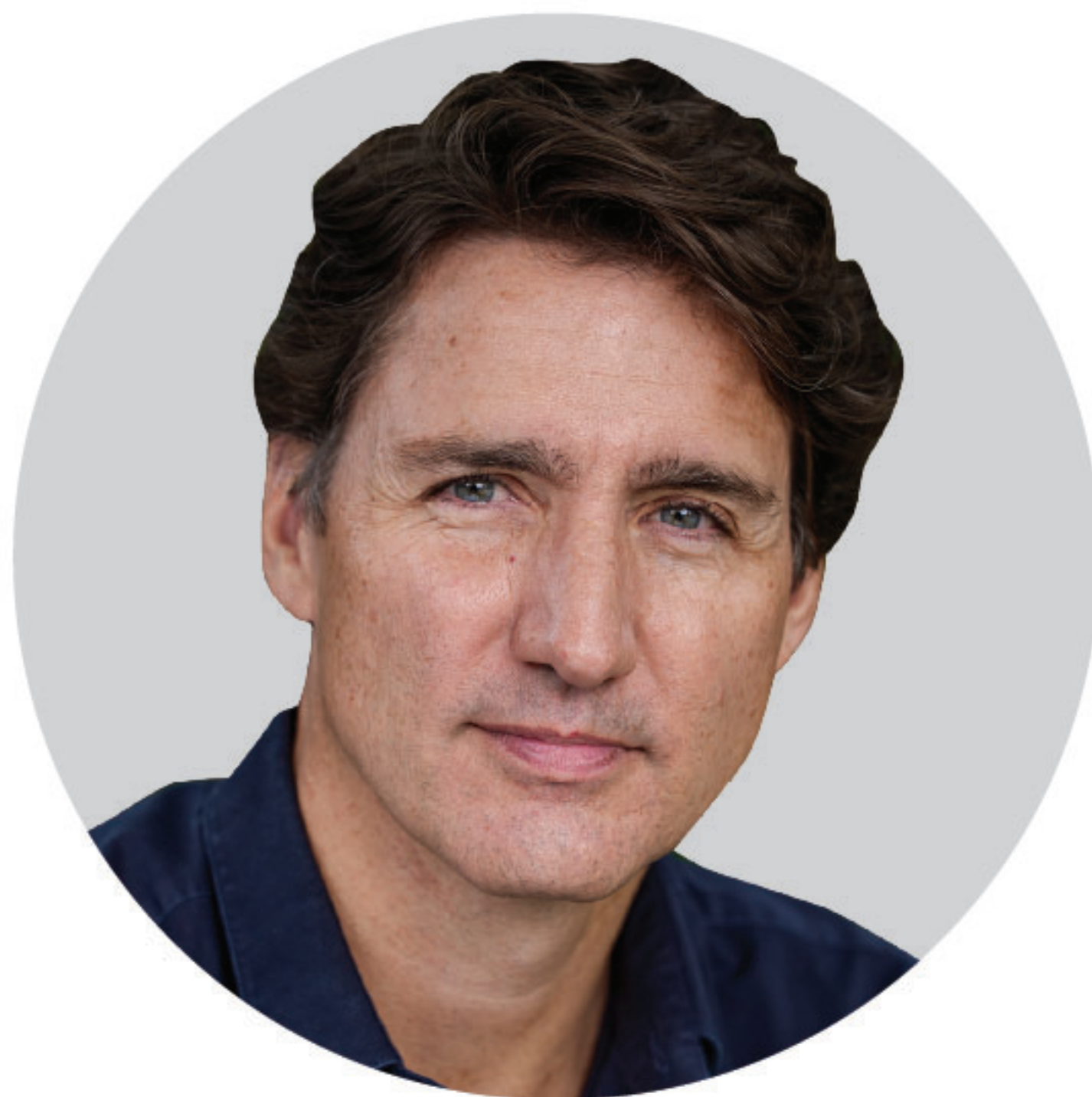
Justin Trudeau The 23rd Prime Minister of Canada

Serving as the 23rd Prime Minister of Canada from 2015 to 2025, he led reforms including strengthening the middle class and forming a gender-balanced cabinet leading the country through an era of global challenges.