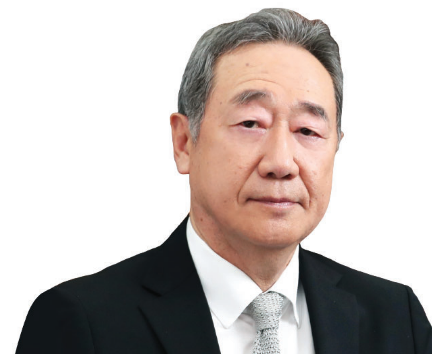
Chairman of Maekyung Media Group Founder of the World Knowledge Forum

The new logo of the World Knowledge Forum embodies the idea of encompassing diverse fields of knowledge from the highest heights to the deepest depths, not only in Asia but across the entire world.