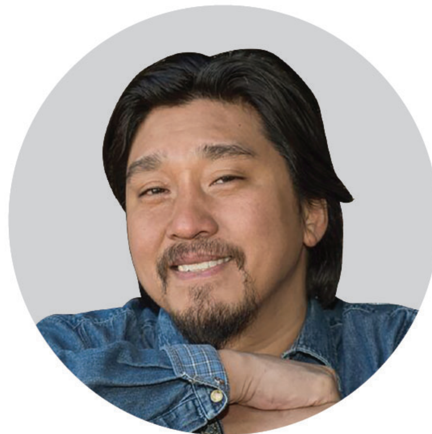
Edward Lee Award Winning Chef & Author

He began his career in the automotive sector at BMW in 1996, eventually serving as a board member. Later, he moved to Volkswagen, where he served as CEO of the passenger car division. He also chaired the audit committees for Volkswagen Group brands such as Skoda, SEAT, and Audi. Diess is recognized as a skilled executive, known for his exceptional preparedness and control in crisis situations. In addition to his global business expertise, he possesses deep insights into future industries such as electric mobility. He studied automotive engineering at Munich University of Applied Sciences and earned his doctorate from the Technical University of Munich.