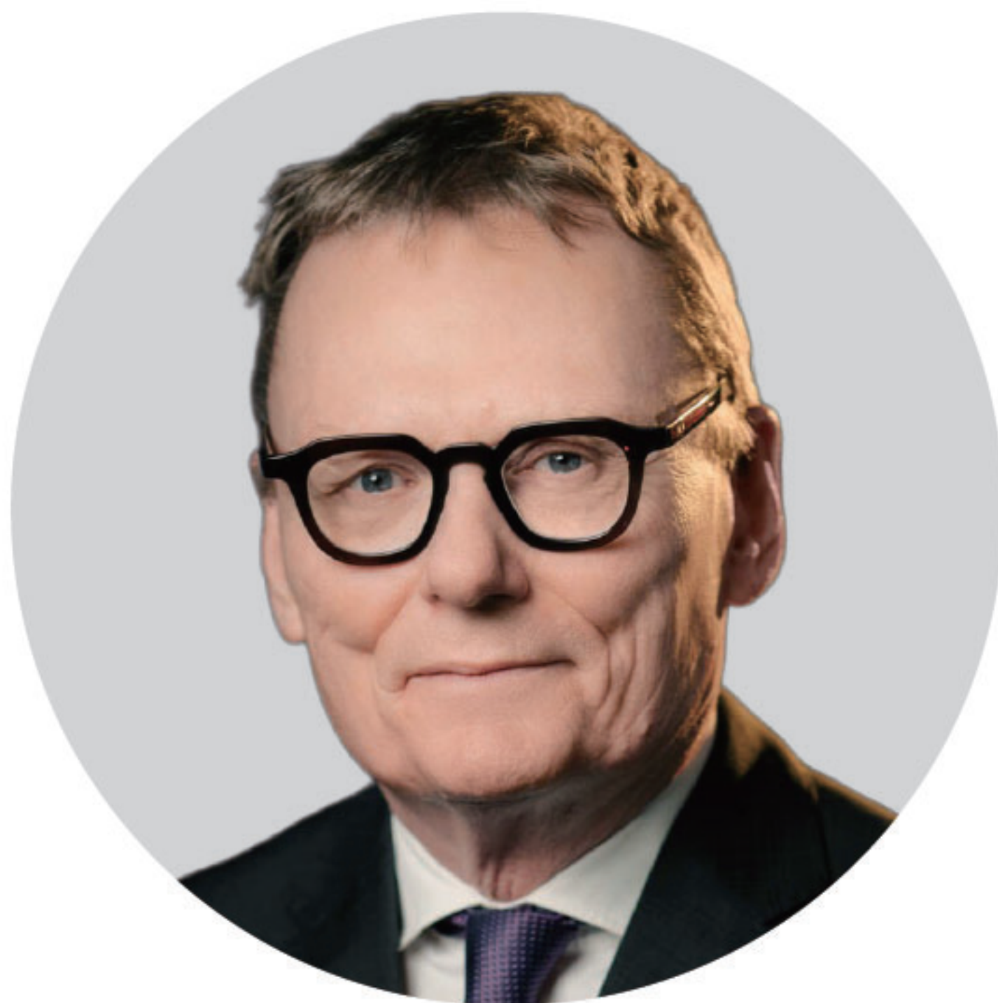
James Robinson 2024 Nobel Laureate in Economics Professor at the University of Chicago

Vista Equity Partners manages over $100 billion in assets and has built a diverse portfolio of technology companies, serving millions of customers worldwide. Smith oversees the firm’s core investment strategies and capital raising, and is an active member of its key investment committees. Since founding Vista in 2000, he has supervised more than 600 transactions with a cumulative value exceeding $315 billion. Known for his innovative investment approach and leadership, Smith was named one of Forbes’ 100 Greatest Living Business Minds in 2017. He earned a bachelor’s degree in chemical engineering from Cornell University and an MBA from Columbia Business School.