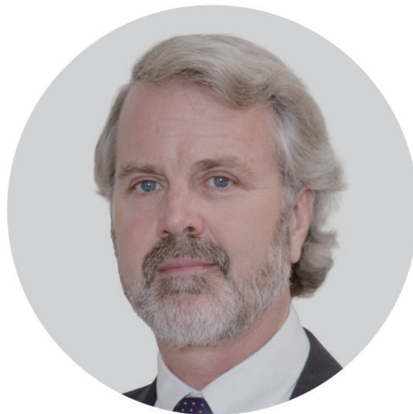
Martin Eberhard Co-founder of Tesla Motors

During his tenure, he implemented a range of policies aimed at economic recovery and financial system stability. Shirakawa is known for his broad experience across monetary policy, financial markets, and crisis management, having joined the Bank of Japan in 1972 and holding various senior roles before becoming a governor. He authored the book “Tumultuous Times: Central Banking in era of Crisis”, which analyzes Japan’s era of high growth, the bursting of its economic bubble, and the subsequent decades-long stagnation, drawing on his direct experience and insights. After retiring from the Bank of Japan, he became an honorary visiting professor at Aoyama Gakuin University.