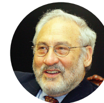
Joseph E. Stiglitz 2001 Nobel Prize Laureate in Economics