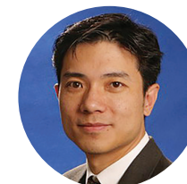
Robin Li Chairman & CEO of Baidu