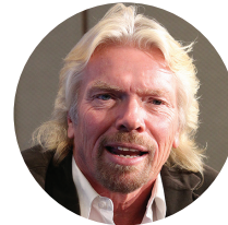
Richard Branson Founder & CEO of Virgin Group