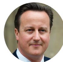
David Cameron Prime Minister of the United Kingdom (2010–2016)