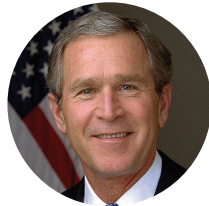
George W. Bush The 43 rd President of the United States