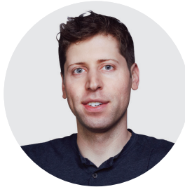
Sam Altman CEO of OpenAI