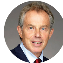
Tony Blair The 73 rd Prime Minister of United Kingdom