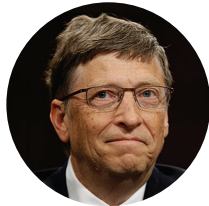
Bill Gates Co-founder of Microsoft Corporation