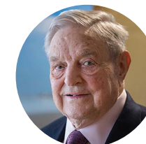
George Soros Chairman of Soros Fund Management