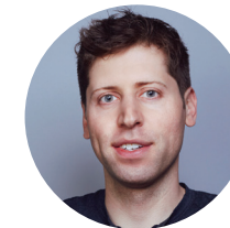
Sam Altman CEO of OpenAI