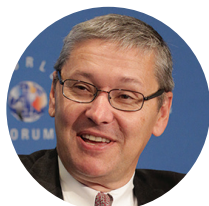
Gregory Mankiw Professor at Harvard University