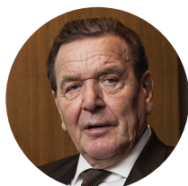
Gerhard Schröder The 7 th Chancellor of Germany