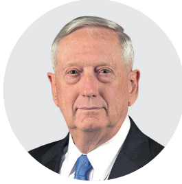
James Norman Mattis The 26 th Secretary of Defense of the United States