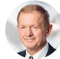
Marcus Wallenberg Chair of the Board of Directors of Skandinaviska Enskilda Banken (SEB)