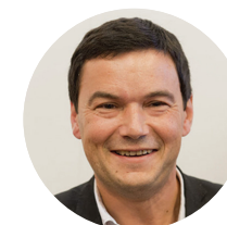
Thomas Piketty Professor at Paris School of Economics