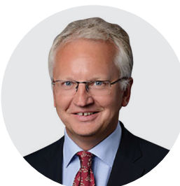
Pär Nuder Former Minister of Finance of Sweden