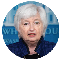
Janet L. Yellen The 15 th Chair of the Federal Reserve board