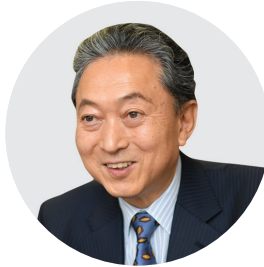
Hatoyama Yukio The 93 rd Prime Minister of Japan