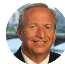
Larry Summers Professor at Harvard University