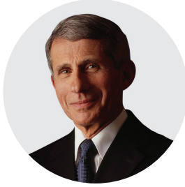
Anthony Fauci The 5 th Director of National Institute of Allergy and Infectious Diseases