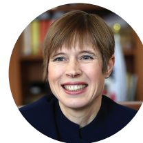
Kersti Kaljulaid President of Estonia