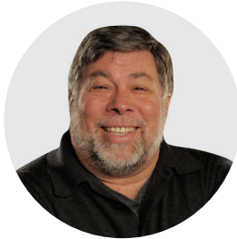
Steve Wozniak Co-Founder of Apple Computer