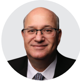
Ilan Goldfajn President of Inter-American Development Bank