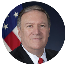
Mike Pompeo The 70 th Secretary of State of the United States