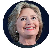
Hillary Rodham Clinton The 67 th United States Secretary of State