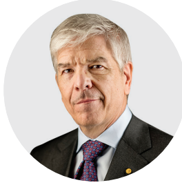
Paul Romer Professor at Boston College (2018 Nobel Economics Prize Laureate)