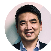
Eric Yuan Founder & CEO of Zoom