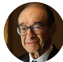
Alan Greenspan The 13 th Chairman of Federal Reserve Board