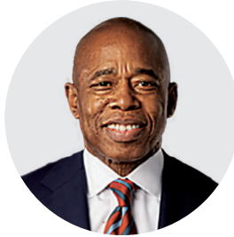
Eric Adams The 110 th Mayor of the City of New York