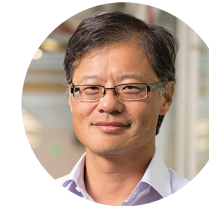
Jerry Yang Founder of Yahoo