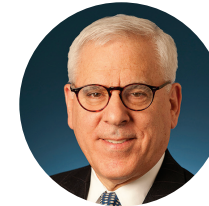
David Rubenstein Co-founder & Co-CEO of the Carlyle Group