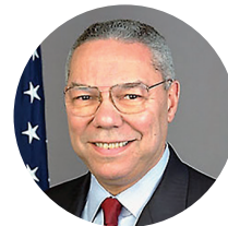
Colin Powell The 65 th United States Secretary of state