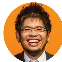
Steve Chen Co-founder of YouTube