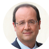
Francois Hollande The 24 th President of France