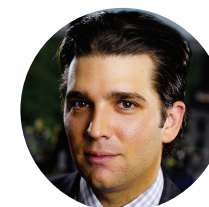
Donald Trump Jr. Executive Vice President of the Trump Organization