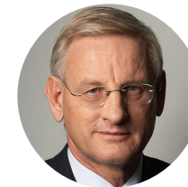
Carl Bildt The 40 th Prime Minister of Sweden & GCIG Commissioner