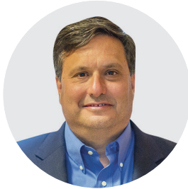
Ron Klain The 30 th White House Chief of Staff