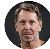
Larry Ellison Chairman & CTO of Oracle Corporation