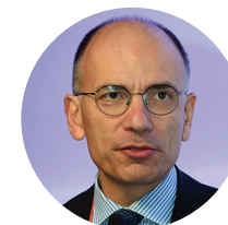
Enrico Letta The 55 th Prime Minister of Italy