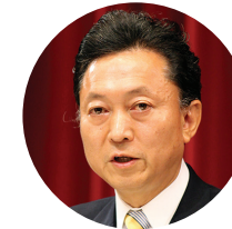
Yukio Hatoyama The 93 rd Prime Minister of Japan