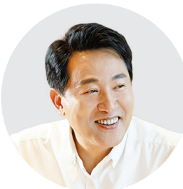
Oh Se-hoon Mayor of Seoul