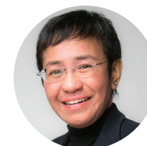
Maria Ressa CEO of Rappler, 2021 Nobel Peace Prize Winner