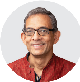
Abhijit Banerjee Professor of Economics at MIT (2019 Nobel Economics Prize Laureate)