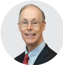
Douglas W. Diamond Professor at University of Chicago (2022 Nobel Economics Prize Laureate)