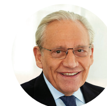
Bob Woodward Pulitzer Prize-Winning Journalist