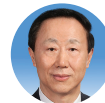
Wang Jia Rui Vice Chairman of the 12 th National Committee of the Chinese People's Political Consultative Conference