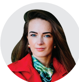
Oleksandra Matviichuk Founder and CEO of the Centre for Civil Liberties (2022 Nobel Peace Prize Laureate)