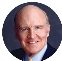
Jack Welch Former Chairman of General Electric