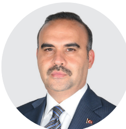
Mehmet Fatih Kacir Miniter of Industry and Technology of Türkiye