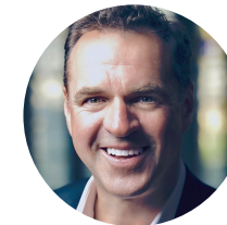
Niall Ferguson Professor at Harvard University