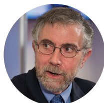
Paul Krugman Professor at City University of New York