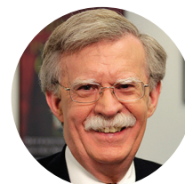
John Bolton National Security Advisor (2018–2019)