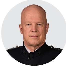
John Raymond The 1 st Chief of Space Operations of U.S. Space Force