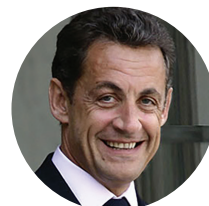
Nicolas Sarkozy The 23 rd President of France